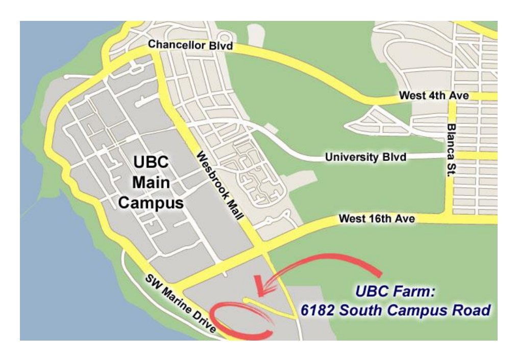
Figure 1: Map of UBC

The University Town's South Campus Neighborhood Plan is currently underway to develop a community consisting of residential, professional, and institutional facilities in the South Campus Area (UBC Town Times). Although future routes to serve the new community are uncertain, the extension of routes closer to the farm is necessary to provide easier access to the UBC Farmers Market.