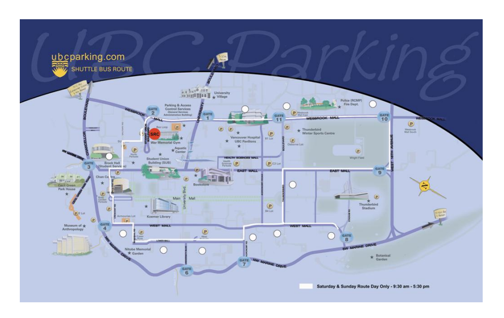
Figure 2: UBC Shuttle Bus Route

According to the UBC Farm Program Coordinator, Mark Bomford, the UBC Farm has contacted UBC Shuttle services in previous years in hopes of expanding the current shuttle route to include a drop-off/pick-up location closer to, or at the UBC farm. Suggestions for the expansion of current routes were declined. As a result, we contacted UBC Parking & Access Control Services and were informed by Shannon Ezart, Enforcement/Shuttle Supervisor, that as of April 7, UBC Campus Shuttle Service will no longer be in operation unless more funds were made available. Figure 2 shows the current route that the UBC Campus Shuttle Services operate at.